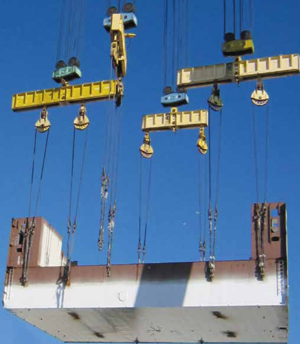
1000 t gantry crane